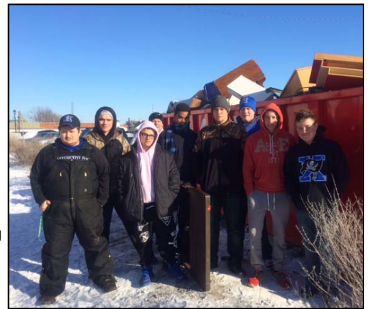
Members of the Xenia football team braved the bitter cold to help clean out TI's basement.

"On behalf of the entire Toward Independence (TI) management team, I would like to thank the Xenia High School football team for braving the bitter cold to assist our organization with the basement clean-up project. We would not have been able to complete this much-needed endeavor without the help of the hardworking and