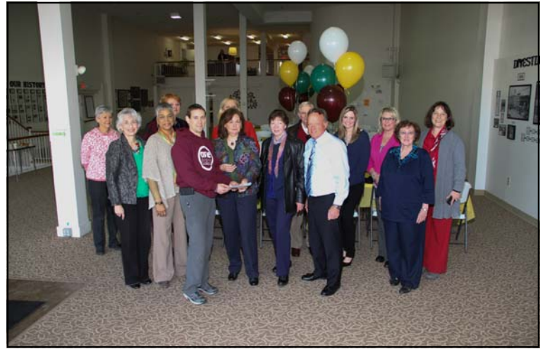
The 100 Women Check Presentation was held on Thursday, March 12 at TI. Representatives from One Bistro, 100 Women, TI and the City of Xenia were on hand for the check presentations.

“Our mission is to provide a place where our neighbors eat and come together as one community. This is regardless of race, gender, developmental