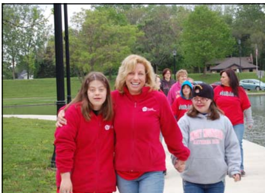
Clients and employees alike enjoy the TI Walk for Independence.

Stay tuned to TI's website and Facebook page for more information about this year's Walk for Independence.